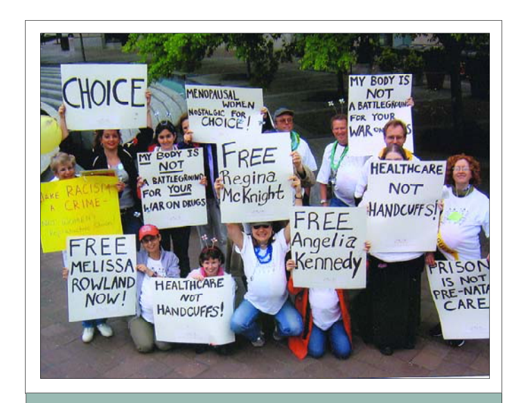
April 25, 2004: A group of activists begin to gather for the March for Women's Lives.

We hope 2005 will see an increase in both foundation and individual support of NAPW's visionary work.