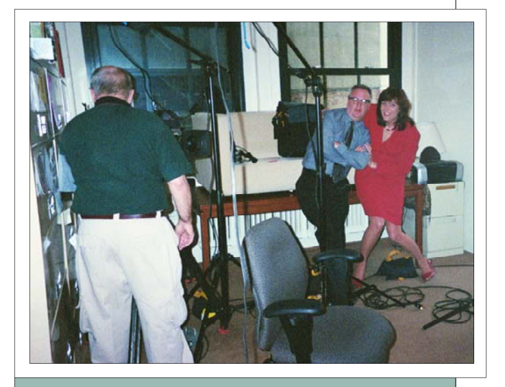
Making Room for the Media: NAPW office furniture is rearranged by the CBS Early Show staff, for an NAPW television interview.

In 2004 NAPW was quoted in, referred to, or appeared in diverse range of media outlets and including the New York Times, Newsweek, The Village Voice, ColorLines Magazine, Rochester Democrat & Chronicle, Salt Lake City Tribune, Seattle Post-Intelligencer, CBS Early Show, MSNBC, and a variety of radio stations across the country. We also reached international audiences through the Philippine Daily Inquirer, The Guardian (London), Bristol United Press, CBC and BBC Radio. Each appearance provided an opportunity to educate audiences about the myths and misinformation relating to pregnancy and parenting, drug use, the war on drugs, and to challenge anti-abortion legislation as a divisive